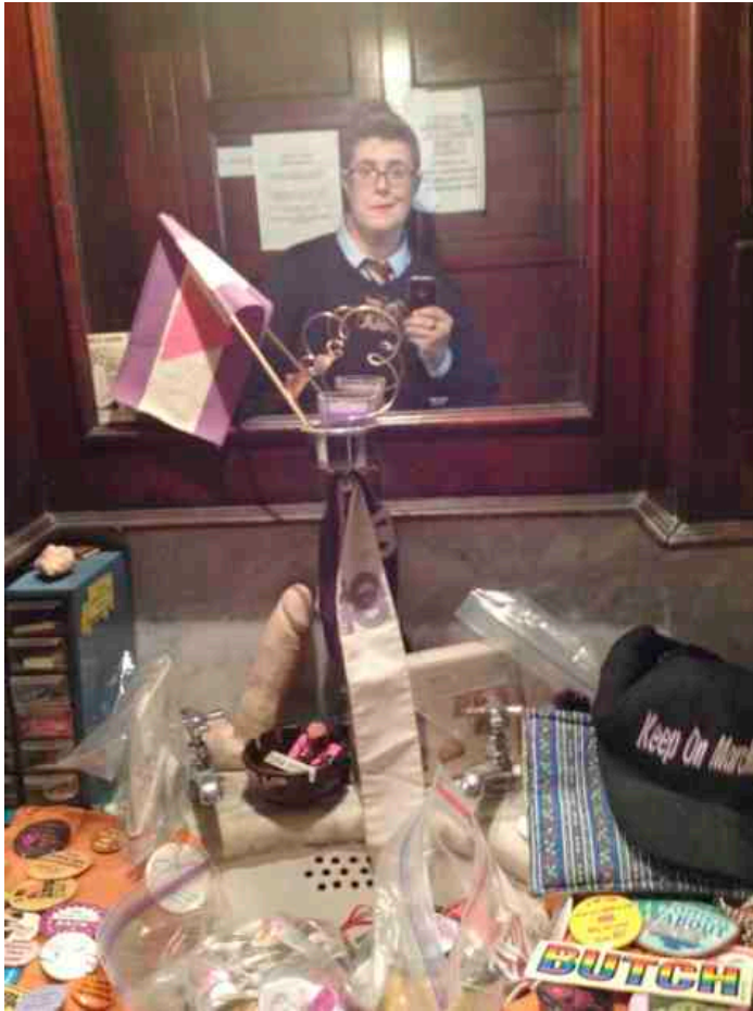
Figure 2. The author at the original bathroom sink in the master bedroom in the Lesbian Herstory Archives.

Do not cite, quote, or reprint without written permission from author. Instead cite: 2015. Giesecking, J. Useful Instability: the Queer Social and Spatial Production of the Lesbian Herstory Archives. Radical History Review [Queering Archives: Intimate Tracing issue], 2015(122): 25-37.